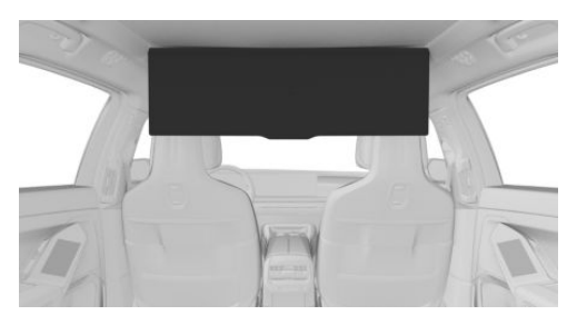
BMW Theater Screen